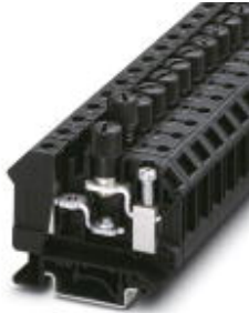
Fuse terminal block for cartridge fuse insert, cross section: 0.5 - 16 mm 2 , AWG: 24 - 6, width: 12 mm, color: black

Please be informed that the data shown in this PDF Document is generated from our Online Catalog. Please find the complete data in the user's documentation. Our General Terms of Use for Downloads are valid ( http://phoenixcontact.com/download )