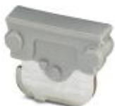
Feed-through connector, length: 10.5 mm, width: 4 mm, color: gray

Feed-through connector - P-FIX - 3038956