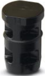
Filler plugs, length: 20 mm, diameter: 13 mm, color: black

Please be informed that the data shown in this PDF Document is generated from our Online Catalog. Please find the complete data in the user's documentation. Our General Terms of Use for Downloads are valid ( http://phoenixcontact.com/download )