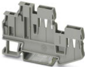
Self-locking flange, width: 5.2 mm, height: 40 mm, color: gray, mounting type: NS 35/7,5, NS 35/15

Please be informed that the data shown in this PDF Document is generated from our Online Catalog. Please find the complete data in the user's documentation. Our General Terms of Use for Downloads are valid ( http://phoenixcontact.com/download )