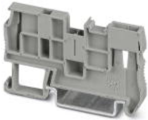
Self-locking flange, width: 5.2 mm, height: 35.3 mm, color: gray, mounting type: NS 35/7,5, NS 35/15

Please be informed that the data shown in this PDF Document is generated from our Online Catalog. Please find the complete data in the user's documentation. Our General Terms of Use for Downloads are valid ( http://phoenixcontact.com/download )