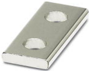
Connection element, length: 62 mm, width: 25 mm, height: 4 mm, number of positions: 2, color: silver

Please be informed that the data shown in this PDF Document is generated from our Online Catalog. Please find the complete data in the user's documentation. Our General Terms of Use for Downloads are valid ( http://phoenixcontact.com/download )