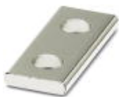
Connection element, length: 62 mm, width: 25 mm, height: 4 mm, number of positions: 2, color: silver

Connection element - HV M12/1-VS 2 - 3049631