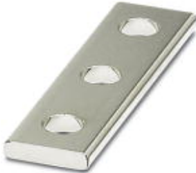
Connection element, length: 96 mm, width: 25 mm, height: 4 mm, number of positions: 3, color: silver

Please be informed that the data shown in this PDF Document is generated from our Online Catalog. Please find the complete data in the user's documentation. Our General Terms of Use for Downloads are valid ( http://phoenixcontact.com/download )