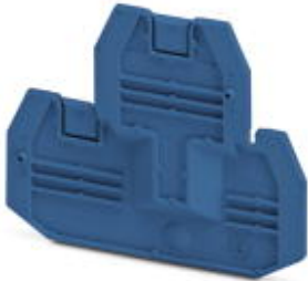
End cover, length: 69.9 mm, width: 2.2 mm, height: 57.5 mm, color: blue

Please be informed that the data shown in this PDF Document is generated from our Online Catalog. Please find the complete data in the user's documentation. Our General Terms of Use for Downloads are valid ( http://phoenixcontact.com/download )