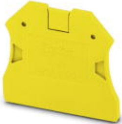
End cover, length: 47 mm, width: 2.2 mm, height: 39.8 mm, color: yellow

Please be informed that the data shown in this PDF Document is generated from our Online Catalog. Please find the complete data in the user's documentation. Our General Terms of Use for Downloads are valid ( http://phoenixcontact.com/download )