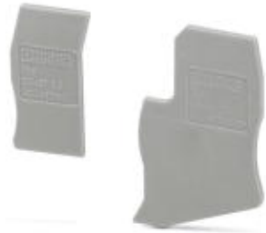
Cover segment, length: 72 mm, height: 36.5 mm, color: gray

Please be informed that the data shown in this PDF Document is generated from our Online Catalog. Please find the complete data in the user's documentation. Our General Terms of Use for Downloads are valid ( http://phoenixcontact.com/download )