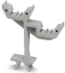
Double marker carrier, snaps onto the spring-cage terminal blocks ST 1.5..., labeled with ZB 4 or ZBF 4

Please be informed that the data shown in this PDF Document is generated from our Online Catalog. Please find the complete data in the user's documentation. Our General Terms of Use for Downloads are valid ( http://phoenixcontact.com/download )