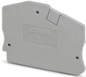
End cover, length: 58 mm, width: 2.2 mm, height: 50 mm, color: gray

Please be informed that the data shown in this PDF Document is generated from our Online Catalog. Please find the complete data in the user's documentation. Our General Terms of Use for Downloads are valid ( http://phoenixcontact.com/download )