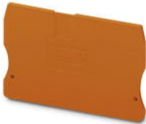
End cover, Length: 71.3 mm, Width: 2.2 mm, Height: 49.9 mm, Color: orange

Please be informed that the data shown in this PDF Document is generated from our Online Catalog. Please find the complete data in the user's documentation. Our General Terms of Use for Downloads are valid ( http://phoenixcontact.com/download )