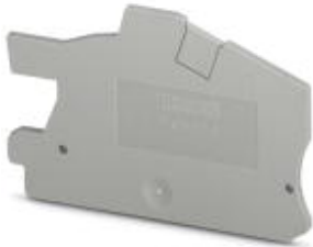
End cover, length: 59.5 mm, width: 2.2 mm, height: 35.3 mm, color: gray

Please be informed that the data shown in this PDF Document is generated from our Online Catalog. Please find the complete data in the user's documentation. Our General Terms of Use for Downloads are valid ( http://phoenixcontact.com/download )