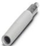
Female test connector, color: white

Female test connector - PSBJ-URTK 6 WH - 3026448