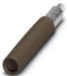
Female test connector, color: brown

Female test connector - PSBJ-URTK 6 BN - 3026971