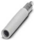
Female test connector, color: transparent

Female test connector - PSBJ-URTK 6 FARBLOS - 3026450