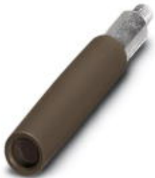
Female test connector, color: brown

Please be informed that the data shown in this PDF Document is generated from our Online Catalog. Please find the complete data in the user's documentation. Our General Terms of Use for Downloads are valid ( http://phoenixcontact.com/download )