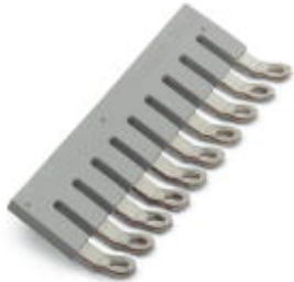
Insertion bridge, pitch: 9 mm, number of positions: 10, color: gray

Please be informed that the data shown in this PDF Document is generated from our Online Catalog. Please find the complete data in the user's documentation. Our General Terms of Use for Downloads are valid ( http://phoenixcontact.com/download )