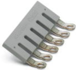
Insertion bridge, pitch: 9 mm, number of positions: 6, color: gray

Please be informed that the data shown in this PDF Document is generated from our Online Catalog. Please find the complete data in the user's documentation. Our General Terms of Use for Downloads are valid ( http://phoenixcontact.com/download )