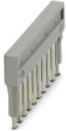
Plug-in bridge, pitch: 5.2 mm, number of positions: 10, color: gray

Please be informed that the data shown in this PDF Document is generated from our Online Catalog. Please find the complete data in the user's documentation. Our General Terms of Use for Downloads are valid ( http://phoenixcontact.com/download )