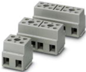
Device terminal block, for direct mounting, 2-pos.

Please be informed that the data shown in this PDF Document is generated from our Online Catalog. Please find the complete data in the user's documentation. Our General Terms of Use for Downloads are valid ( http://phoenixcontact.com/download )