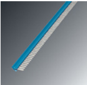
Plug-in bridge, pitch: 5.2 mm, number of positions: 80, color: blue

Please be informed that the data shown in this PDF Document is generated from our Online Catalog. Please find the complete data in the user's documentation. Our General Terms of Use for Downloads are valid ( http://phoenixcontact.com/download )