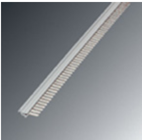
Plug-in bridge, pitch: 5.2 mm, number of positions: 80, color: gray

Please be informed that the data shown in this PDF Document is generated from our Online Catalog. Please find the complete data in the user's documentation. Our General Terms of Use for Downloads are valid ( http://phoenixcontact.com/download )