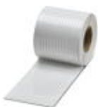
Marking foil for zack marker strip, white, labeled according to customer specifications, mounting type: adhesive, for terminal block width: 4.15 mm, lettering field size: continuous x 3.8 mm

Marking foil for zack marker strip - SK 3,8 REEL P4,15 WH CUS - 0825990