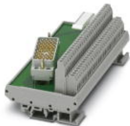
Interface module, connection 1: Screw connection, connection 2: ELCO connector 1x 56-position (Pin strip, Type 8016, right)

Please be informed that the data shown in this PDF Document is generated from our Online Catalog. Please find the complete data in the user's documentation. Our General Terms of Use for Downloads are valid ( http://phoenixcontact.com/download )