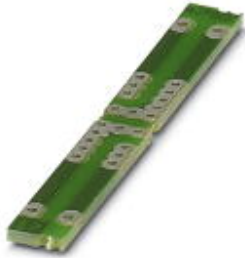
PCB for assembling electronic components

Please be informed that the data shown in this PDF Document is generated from our Online Catalog. Please find the complete data in the user's documentation. Our General Terms of Use for Downloads are valid ( http://phoenixcontact.com/download )