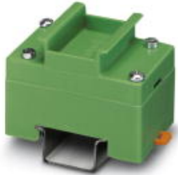
Mounting plate, closed version, for screwing on size 0 switchgear

Please be informed that the data shown in this PDF Document is generated from our Online Catalog. Please find the complete data in the user's documentation. Our General Terms of Use for Downloads are valid ( http://phoenixcontact.com/download )