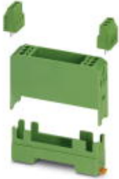
Electronic housing set, consisting of electronic housing and printed circuit termination blocks, pitch 5

Please be informed that the data shown in this PDF Document is generated from our Online Catalog. Please find the complete data in the user's documentation. Our General Terms of Use for Downloads are valid ( http://phoenixcontact.com/download )