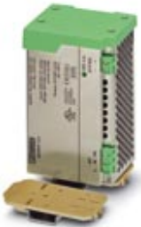
Adapter for mounting QUINT-POWER power supply units, 1 A, 2.5 A, and 5 A, at a 90° angle to the DIN rail

Please be informed that the data shown in this PDF Document is generated from our Online Catalog. Please find the complete data in the user's documentation. Our General Terms of Use for Downloads are valid ( http://phoenixcontact.com/download )