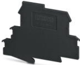
End cover for TERMITRAB TT-2-PE-M... and TT-2/2-M...

Please be informed that the data shown in this PDF Document is generated from our Online Catalog. Please find the complete data in the user's documentation. Our General Terms of Use for Downloads are valid ( http://phoenixcontact.com/download )