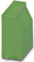
DIN rail housing, Filler plug for unoccupied terminal points, color: green (6021)

Please be informed that the data shown in this PDF Document is generated from our Online Catalog. Please find the complete data in the user's documentation. Our General Terms of Use for Downloads are valid ( http://phoenixcontact.com/download )