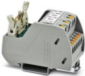
VARIOFACE Professional (VIP) board for the ROC800 controller

Please be informed that the data shown in this PDF Document is generated from our Online Catalog. Please find the complete data in the user's documentation. Our General Terms of Use for Downloads are valid ( http://phoenixcontact.com/download )