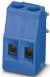
PCB terminal block

Please be informed that the data shown in this PDF Document is generated from our Online Catalog. Please find the complete data in the user's documentation. Our General Terms of Use for Downloads are valid ( http://phoenixcontact.com/download )