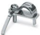
Shield connection clamp for printed circuit terminal block