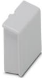
Installation component housing, Filler plug; 35.6, width: 35.6 mm, color: Light gray (7035)

Please be informed that the data shown in this PDF Document is generated from our Online Catalog. Please find the complete data in the user's documentation. Our General Terms of Use for Downloads are valid ( http://phoenixcontact.com/download )