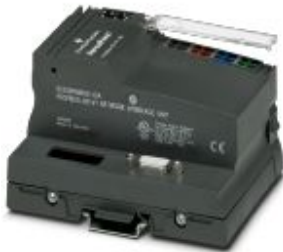
VersaPoint PROFIBUS DP/V1-NIU, 24 V DC, complete with accessories (plug and labeling field)

Please be informed that the data shown in this PDF Document is generated from our Online Catalog. Please find the complete data in the user's documentation. Our General Terms of Use for Downloads are valid ( http://phoenixcontact.com/download )