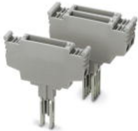
Component plug, for 4-pos. components, two basic terminal blocks required per plug, 19 mm high

Please be informed that the data shown in this PDF Document is generated from our Online Catalog. Please find the complete data in the user's documentation. Our General Terms of Use for Downloads are valid ( http://phoenixcontact.com/download )