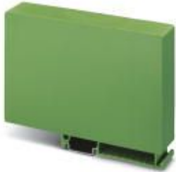
Component housing, Base element

Please be informed that the data shown in this PDF Document is generated from our Online Catalog. Please find the complete data in the user's documentation. Our General Terms of Use for Downloads are valid ( http://phoenixcontact.com/download )