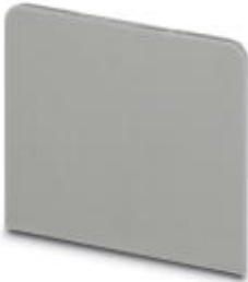
Separating plate, width: 0.5 mm, color: gray

Please be informed that the data shown in this PDF Document is generated from our Online Catalog. Please find the complete data in the user's documentation. Our General Terms of Use for Downloads are valid ( http://phoenixcontact.com/download )