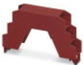
Upper part of the housing

Upper part of housing - ME 22,5 OT-3MSTBO RD - 2697181