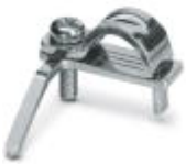
Shield connection clamp for printed circuit terminal block

Shield connection clamp - ME-SAS - 2853899