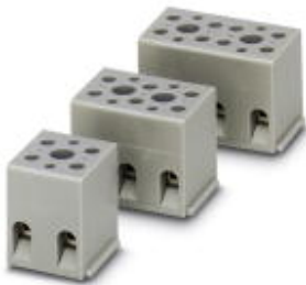
Device terminal block, for direct mounting, 12-pos.

Please be informed that the data shown in this PDF Document is generated from our Online Catalog. Please find the complete data in the user's documentation. Our General Terms of Use for Downloads are valid ( http://phoenixcontact.com/download )