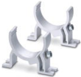
Mounting holder, AlMgSi0,5: Aluminum, for machine lights PLD M 260 .../D40, Swiveling range \pm 20^\circ

Please be informed that the data shown in this PDF Document is generated from our Online Catalog. Please find the complete data in the user's documentation. Our General Terms of Use for Downloads are valid ( http://phoenixcontact.com/download )