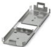
Mounting plate for Axioline E metal devices