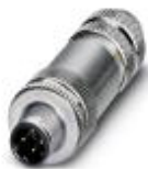
Bus system connector, Ethernet/PROFINET CAT5 (100 Mbps), 4-position, shielded, Plug straight M12, Screw connection, knurl material: Zinc die-cast, nickel-plated, cable gland Pg9, external cable diameter 6 mm ... 8 mm

Bus system connector - SACC-M12MSD-4CON-PG 9-SH - 1521261