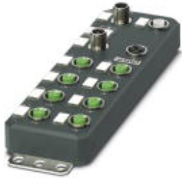
Axioline E PROFIBUS device in a plastic housing with 8 digital inputs and 8 digital outputs, 24 V DC, M12 fast connection technology

Please be informed that the data shown in this PDF Document is generated from our Online Catalog. Please find the complete data in the user's documentation. Our General Terms of Use for Downloads are valid ( http://phoenixcontact.com/download )