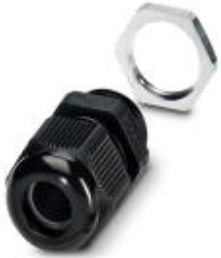
M16 cable threaded joint x 1.5 mm, black

Please be informed that the data shown in this PDF Document is generated from our Online Catalog. Please find the complete data in the user's documentation. Our General Terms of Use for Downloads are valid ( http://phoenixcontact.com/download )