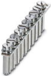
Fixed bridge, pitch: 5 mm, number of positions: 10, color: silver

Please be informed that the data shown in this PDF Document is generated from our Online Catalog. Please find the complete data in the user's documentation. Our General Terms of Use for Downloads are valid ( http://phoenixcontact.com/download )