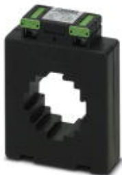
Window-type current transformer, 500 A AC primary current; 5 A AC secondary current; accuracy class 1; 15 VA rated power

Please be informed that the data shown in this PDF Document is generated from our Online Catalog. Please find the complete data in the user's documentation. Our General Terms of Use for Downloads are valid ( http://phoenixcontact.com/download )