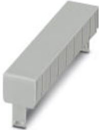
Component housing, Cover, Color: light gray, Width: 18.9 mm, Length: 87.8 mm, Height: 12.2 mm

Please be informed that the data shown in this PDF Document is generated from our Online Catalog. Please find the complete data in the user's documentation. Our General Terms of Use for Downloads are valid ( http://phoenixcontact.com/download )