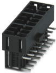
HSC header, touch-proof, 3 units, 18 connections, please note the positioning, color: black

Please be informed that the data shown in this PDF Document is generated from our Online Catalog. Please find the complete data in the user's documentation. Our General Terms of Use for Downloads are valid ( http://phoenixcontact.com/download )