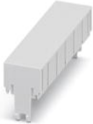
DIN rail housing, 6U, Housing cover, width: 18.9 mm, color: light gray (7035)

Please be informed that the data shown in this PDF Document is generated from our Online Catalog. Please find the complete data in the user's documentation. Our General Terms of Use for Downloads are valid ( http://phoenixcontact.com/download )